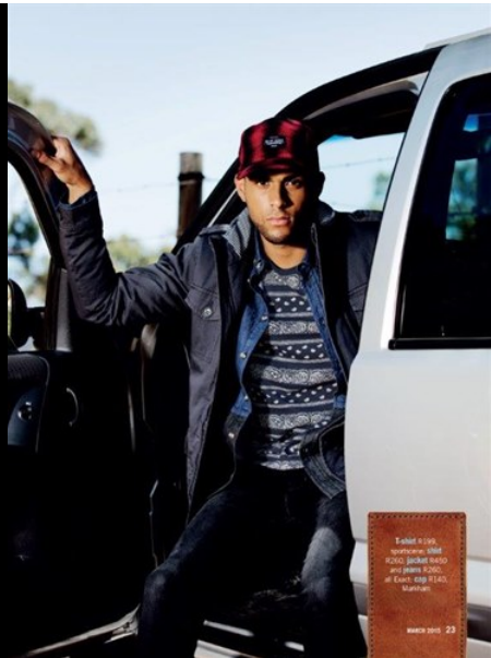
Jacket $199, t-shirt $69, and jeans $200, at East City FLAK, Manhattan March 2012 23